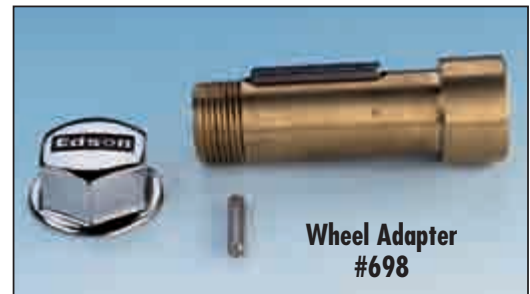
Wheel Adapter #698