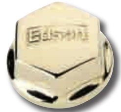
Brass Wheel Nut #673BR